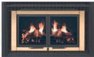
GOLD FRAME UNIT WITH BLACK DOORS