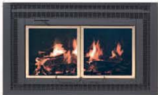
BLACK UNIT WITH GOLD DOORS