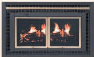
BLACK UNIT WITH GOLD DOORS & DECORATIVE GOLD TRIM