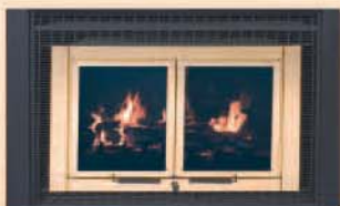
GOLD FRAME UNIT WITH GOLD DOORS

The Fuego Insert's positive flue connection sealing plate insures a tight seal and prevents dirt and smoke from re-entering firebox. It uses minimal air consumption similar to an air tight stove. Uses less air in one day than a conventional fireplace uses in an hour